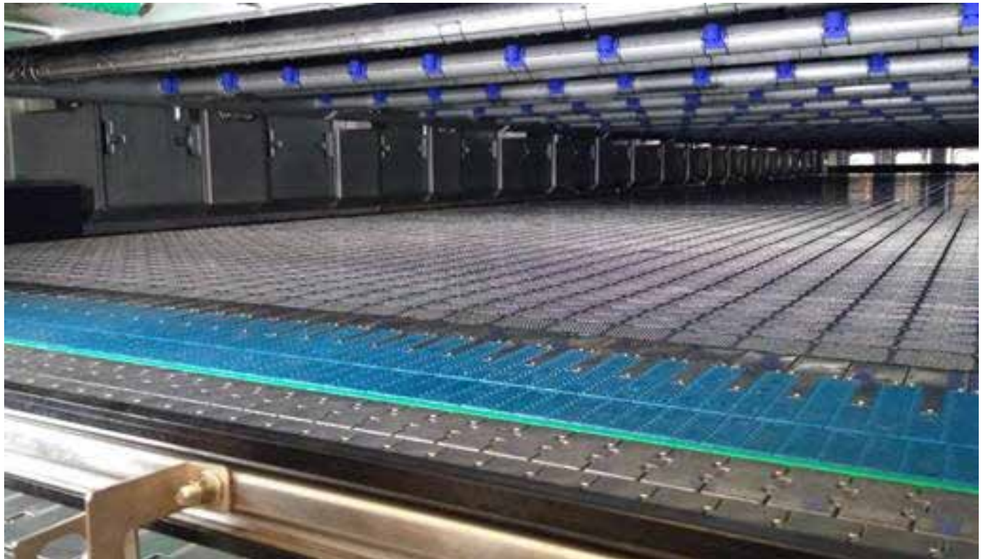
Rexnord 9406 Series MatTop Chain